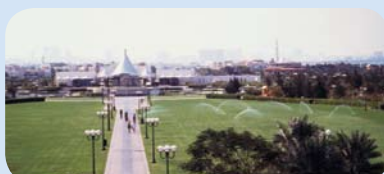
Mumza Park, Dubai, UAE