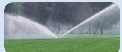
San Diego, California, USA