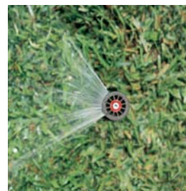
Top: Simplicity, reliability and performance have made the PS popular worldwide. Left: Color-coded radius identification ring and a radius adjustment screw for fine-tuning arc and radius.