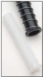
PS features an extra large filter screen and super strong retraction spring.

Fifteen years ago, international irrigation markets from Chile to the Czech Republic discovered that Hunter's innovative PS spray gave them more of what irrigation professionals wanted and less of what they didn't want. That is, more flexibility, more versatility and more profitability...along with less maintenance, less inventory, less installation time and less headaches.