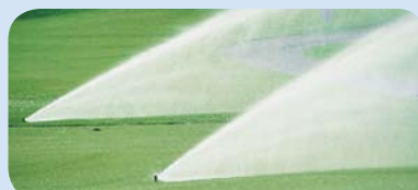
Lost City, South Africa