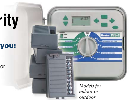
Models for indoor or outdoor installation

Add up the advantages and you'll understand why Hunter's modular Pro-C and ICC are the controllers that make sense for your bottom line. ■