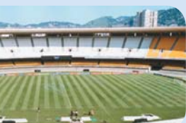
Maracana Stadium, Brazil

Hunter's answer to the "big guns," this rotor covers the I-series largest radius (up to 29 m). Yet, its compact size and cushioned rubber cover make it perfect for parks and wide-open lawn areas, as well as sports fields.