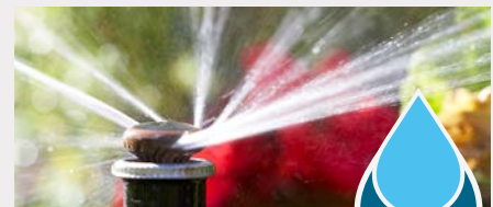
MP Rotator Strips 5' wide

Optimal solution for heavy water application needs, such as tight water windows and spray retrofits.