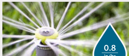
MP Rotator MP800 6' to 24'

Maximize water efficiency with the lowest precipitation rate across the widest radius range in the industry.