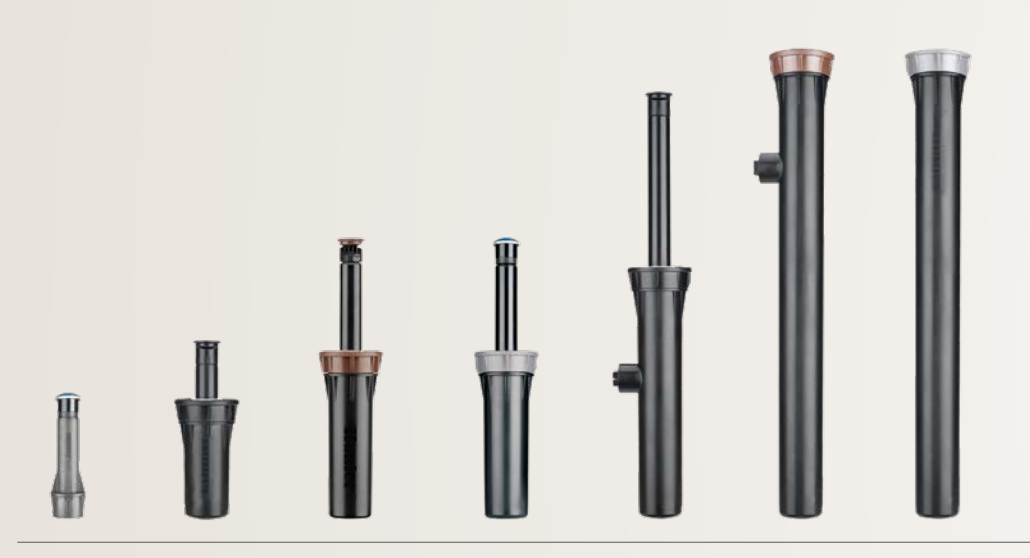
Shown here: PRS40 shrub, Pro-Spray 5 cm, PRS30 and PRS40 10 cm, Pro-Spray 15 cm, and PRS30 and PRS40 30 cm sprays

All models also include a user-friendly, pull-ring flush cap to keep debris and clogging to a minimum. In addition, Pro-Spray Sprinkler Bodies workwith all industry standard female nozzles, offering maximum flexibility.