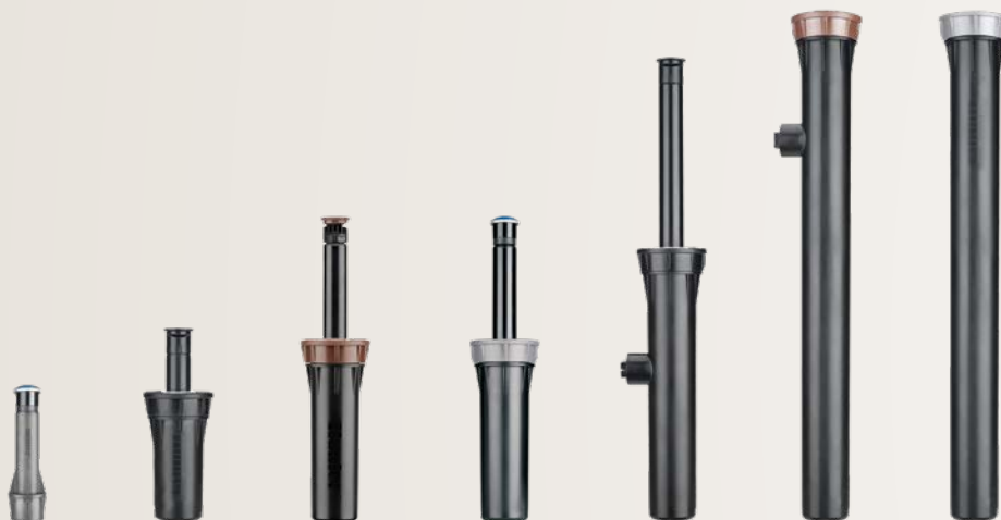
Shown here: PRS40 shrub, Pro-Spray 5 cm, PRS30 and PRS40 10 cm, Pro-Spray 15 cm, and PRS30 and PRS40 30 cm sprays

All models also include a user-friendly, pull-ring flush cap to keep debris and clogging to a minimum. In addition, Pro-Spray Sprinkler Bodies work with all industry standard female nozzles, offering maximum flexibility.