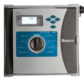
Hunter 360 Software works with an unlimited number of Hunter ACC2 and ICC2 Controllers, making it easy to scale up as your system grows.