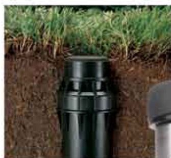
The Pro-Tech™ safety system's small exposed heavy-duty rubber boot keeps playing areas safe.

Hunter also has one of the most advanced testing labs in the industry, located on site at its company headquarters in Southern California. The lab can operate 24 hours a day, testing nozzle performance, and measuring rotation speed, trajectories and