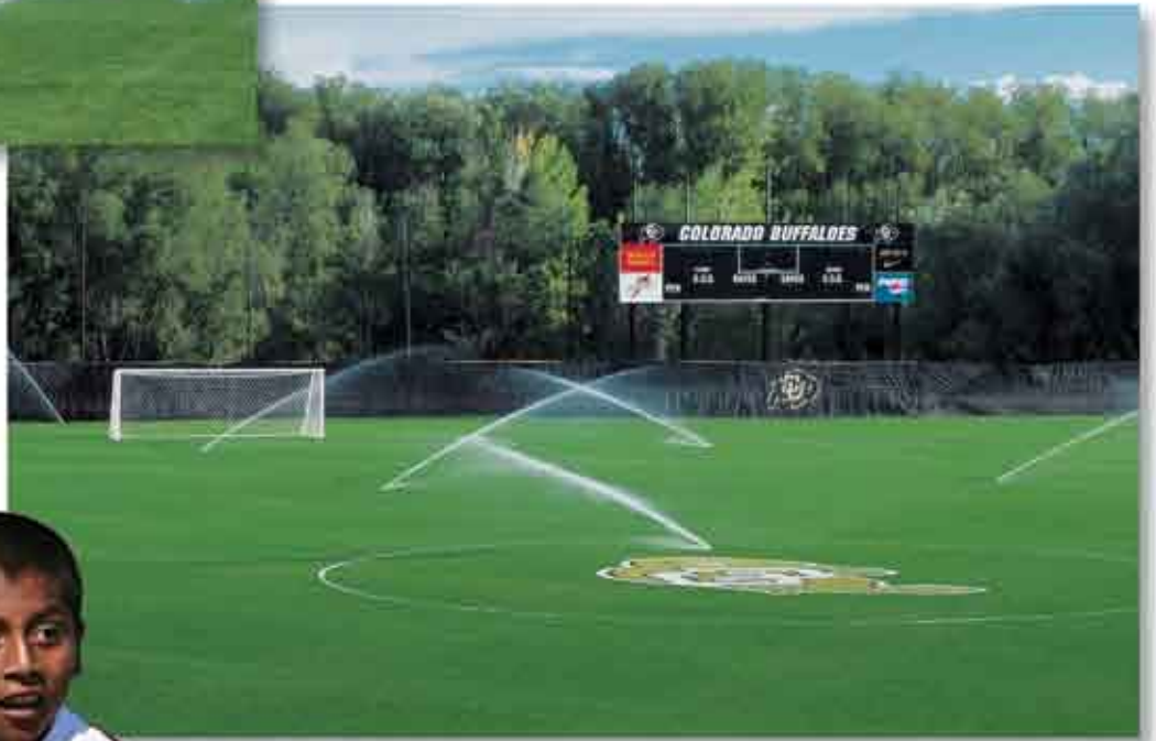
Prentup Field — Colorado