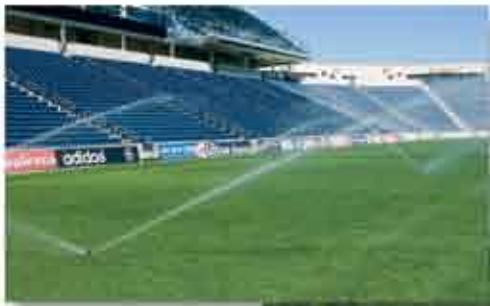
TOYOTA PARK— Illinois