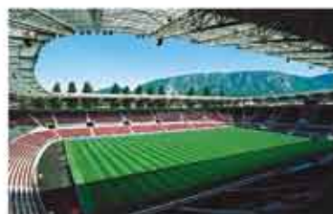
Stade de Geneve—Switzerland