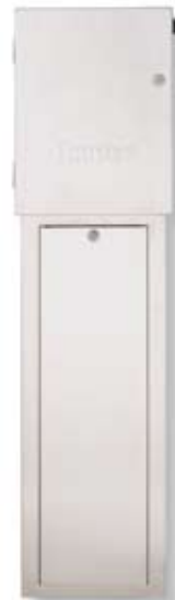
Stainless Steel Pedestal

H unter introduced the concept of personalized construction for controllers—allowing custom tailoring to more effectively handle the odd number of stations a system may require—and the acceptance has been overwhelming. Then again, why shouldn't it be? After all, nothing else makes more sense when seeking the ideal choice to run irrigation systems at virtually any commercial site, from schools, parks, and sports fields to hotels, resorts, and apartment buildings. The idea is a simple one: a controller that's "built" by