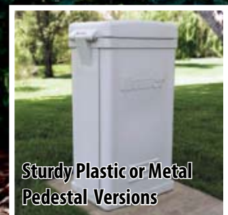
Sturdy Plastic or Metal Pedestal Versions