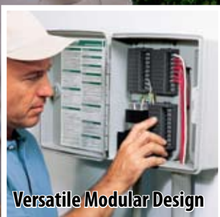
Versatile Modular Design