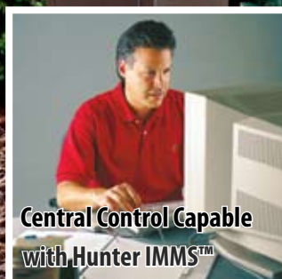
Central Control Capable with Hunter IMMS™