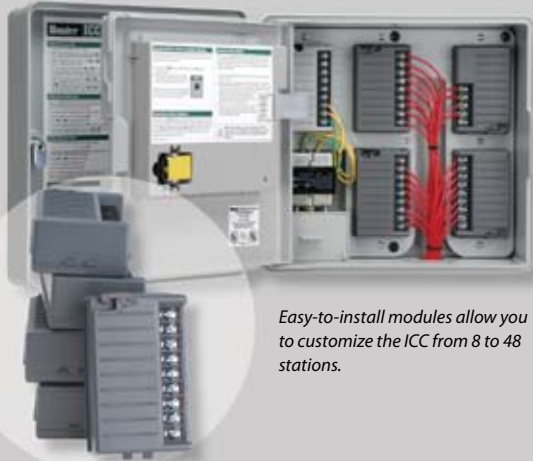
Easy-to-install modules allow you to customize the ICC from 8 to 48 stations.

It's an idea that makes so much sense... while saving you so many dollars. For the professionals who stock and carry controllers, modules make inventory control easy—there's no need to estimate how many of each size controller you need to keep on hand. Now you simply stock modules. And that means, for customers whose systems require a non-standard number of stations, with modules you can customize the controller to the exact needs of the project—even if those needs change as the project grows.