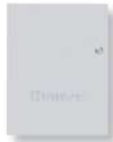
Stainless Steel Cabinet